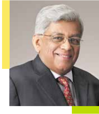
MR. DEEPAK PAREKH , HDFC Limited

The Chairman of HDFC Ltd. is a fellow of the Institute of Chartered Accountants (England & Wales). Besides HDFC Group companies, Mr. Parekh is on the board of several leading corporates across varied sectors. He is always willing to share his ideas and expertise to formulate reform policies across sectors. It is this quality of a master trouble-shooter that makes him a guiding force and an active member of various high powered economic groups and government appointed committees.